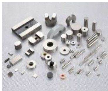
AlNiCo Sintered Curve

AUTOMATIC HYSTERESIS GRAPH MODEL AMT-4 SJLYF